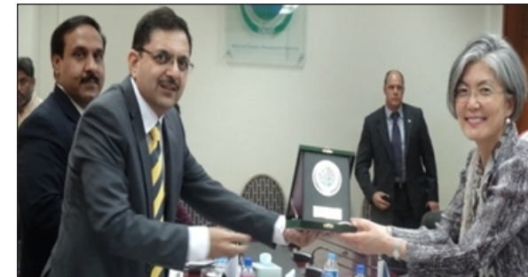
Islamabad 7 th May 2014: Member Operations NDMA presenting a souvenir to United Nations Assistant Secretary General for Humanitarian Affairs/ Deputy Emergency Relief Coordinator, during her visit to NDMA.