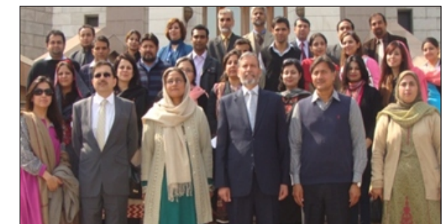
Islamabad 6 th March 2014: Group photograph of Chairman NDMA along with students of Armed Forces Post Graduate Medical Institute Rawalpindi during visit to NDMA.

To orientate and seek the first hand acquaintance, number of trainees from native institutions visit various marked Government/Non Government outfits. NDMA being the forefront and federal agency is one of the pronounced organizations that also hosts and facilitates different educational and training visits of various universities and departments. Trainees of Armed Forces Post Graduate Medical Institute Rawalpindi, Senior Management Course from National Management College Lahore and Foundation University along with faculty members visited NDMA, and were briefed by Operations Wing, NDMA.