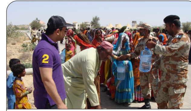
Islamkot 15 th March 2014: Pakistan Rangers distributing relief among drought affectees at tehsil Islamkot, district Tharparkar.