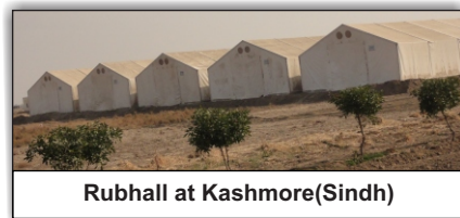
Rubhall at Kashmore(Sindh)

NDMA, in partnership with WFP, is developing a combined network of warehouse facilities ( HRF & Flospans ) at various strategic locations across Pakistan for storage of emergency stock. Recently two mega state of the art HRFs at Muzaffargarh ( Punjab ) and Quetta ( Balochistan ) have been completed on 20 th February and 10 th June 2014 respectively and are functional under PDMA Punjab and Balochistan respectively, while other 26x flospans, are under various stages of construction/installation in various areas. During HRFs handing/ taking over ceremonies Chairman NDMA appreciated WFP for strengthening disaster preparedness and emergency response capacity across the country for stocking reserves, effective & reliable emergency logistics response mechanism at district level. WFP also assisted NDMA in establishing its warehouse at Kashmore (Sindh) comprised of five rubhalls to accommodate strategic emergency stocks.