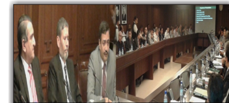
Karachi (Sindh) 19 th May 2014: Chief Secretary Sindh & DG PDMA Sindh briefing on the contingency planning.