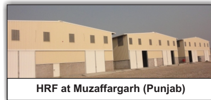
HRF at Muzaffargarh (Punjab)