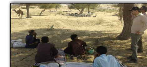
Mithi 09 th March 2014: Member Operations NDMA interacting with drought affectees in Mithi, district Tharparkar.