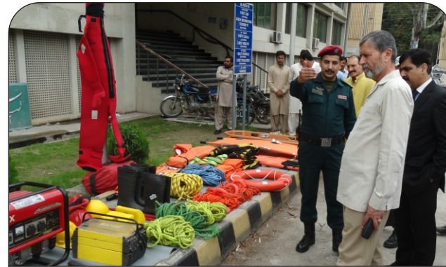
Muzaffarabad 30 th May 2014: District Emergency Officer briefing Chairman NDMA about the capabilities and equipment of 1122 during visit to SDMA, AJK.