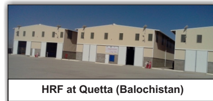
HRF at Quetta (Balochistan)