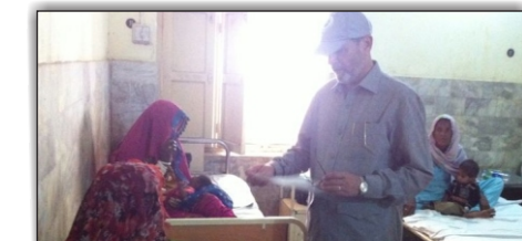
Mithi 09 th March 2014: Chairman NDMA visited the under treatment patients at DHQ hospital Mithi, district Tharparkar.