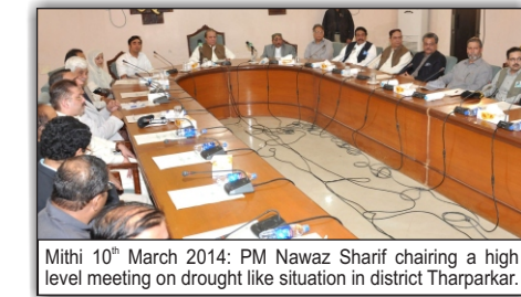
Mithi 10 th March 2014: PM Nawaz Sharif chairing a high level meeting on drought like situation in district Tharparkar.