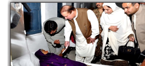
Mithi 10 th March 2014: PM Nawaz Sharif distributed cheques amongst the drought affectees at Mithi, district Tharparkar.