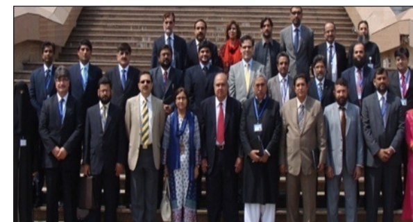
Islamabad 21 st April 2014: Group photograph of Member Operations NDMA along with participants of 15 th Senior Management Course from National Management College.