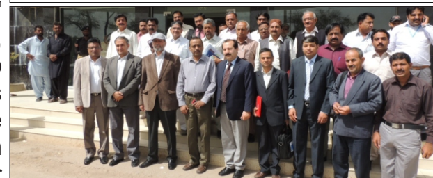
Badin 12 th March 2014: Chairman NDMA during launching ceremony of MHVRA in Badin.