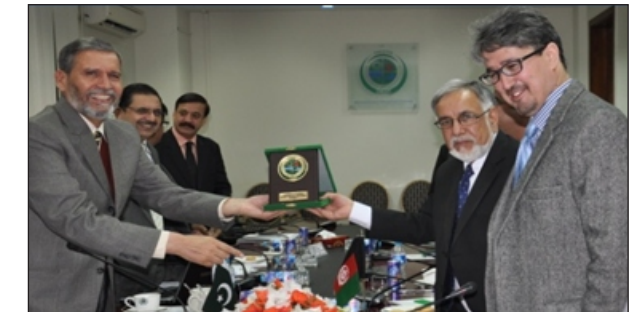
Islamabad 13 th January 2014: Chairman NDMA presenting a souvenir to DG ANDMA during his visit to NDMA.