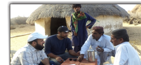
Mithi 15 th March 2014: AD Log NDMA along with NDMA officials during visit to tehsil Dahli, district Tharparkar.