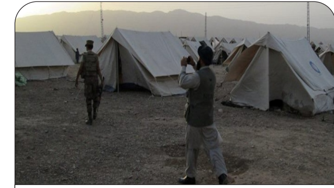
Bannu 23 rd June 2014: Relief Camps established at district Bannu, UC Bakkakhel (KP) for the displaced persons.