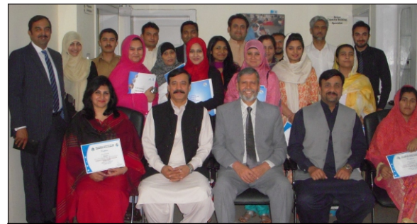
Islamabad 16-18 April 2014: A group photograph of Chairman NDMA along with participants of a three days training course on "Integration of Gender & Vulnerable Groups in DRM"

NIDM also participated in two exhibitions organized by Pakistan Urban Forum at Karachi and Punjab Youth Festival at Lahore. At Punjab Youth Festival, besides showcasing the achievement of NDMA and NIDM, a competition, among the university students on Disaster Resilient Shelters was also adjudicated by NIDM team.