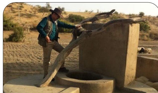
Naukot 11 th March 2014: Member Operations NDMA during inspection of water reservoirs in tehsil Diplo, district Tharparkar