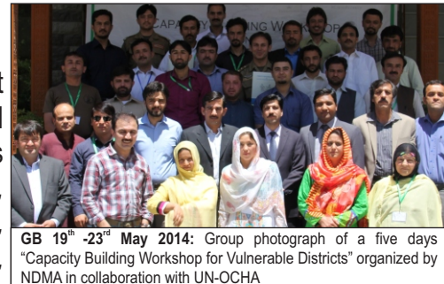
GB 19 th -23 rd May 2014: Group photograph of a five days "Capacity Building Workshop for Vulnerable Districts" organized by NDMA in collaboration with UN-OCHA

NDMA commenced Phase-II of capacity building trainings of Govt Officials in vulnerable districts in order to ensure well coordinated efforts during monsoon 2014. In this regard, training workshops were held in vulnerable districts of Balochistan ( Bolan, Jhal Magsi, Khuzdar, Sibbi, Loralai ) & KPK ( Abbottabad, Haripur, Battagram, Mansehra, Bannu, D.I. Khan, Malakand & Upper Dir ), Punjab ( Chiniot, Mandi Bahaudin, Sahiwal & Kasur ), Sindh ( Sukkur, Shikarpur, Tando Allah Yar, Mirpur Khas, Thatta & Badin ), AJ&K ( Mirpur, Kotli, Neelum and Bagh ), Gilgit-Baltistan ( Hunza-Nagar & Ghizer ) & FATA ( South Waziristan ). In Phase-II, a total of 488 Govt Officials at district received training, including Local Authorities, Public Health, Education Dept., Revenue Dept., Rescue 1122, Police, Armed Forces and local NGOs.