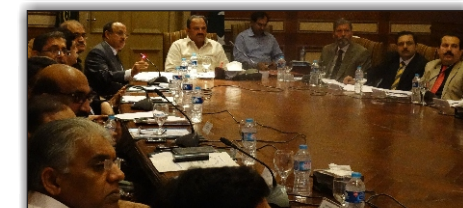
Lahore (Punjab) 30 th April 2014: Chief Secretary Punjab chairing meeting on pre-monsoon preparedness & contingency planning.