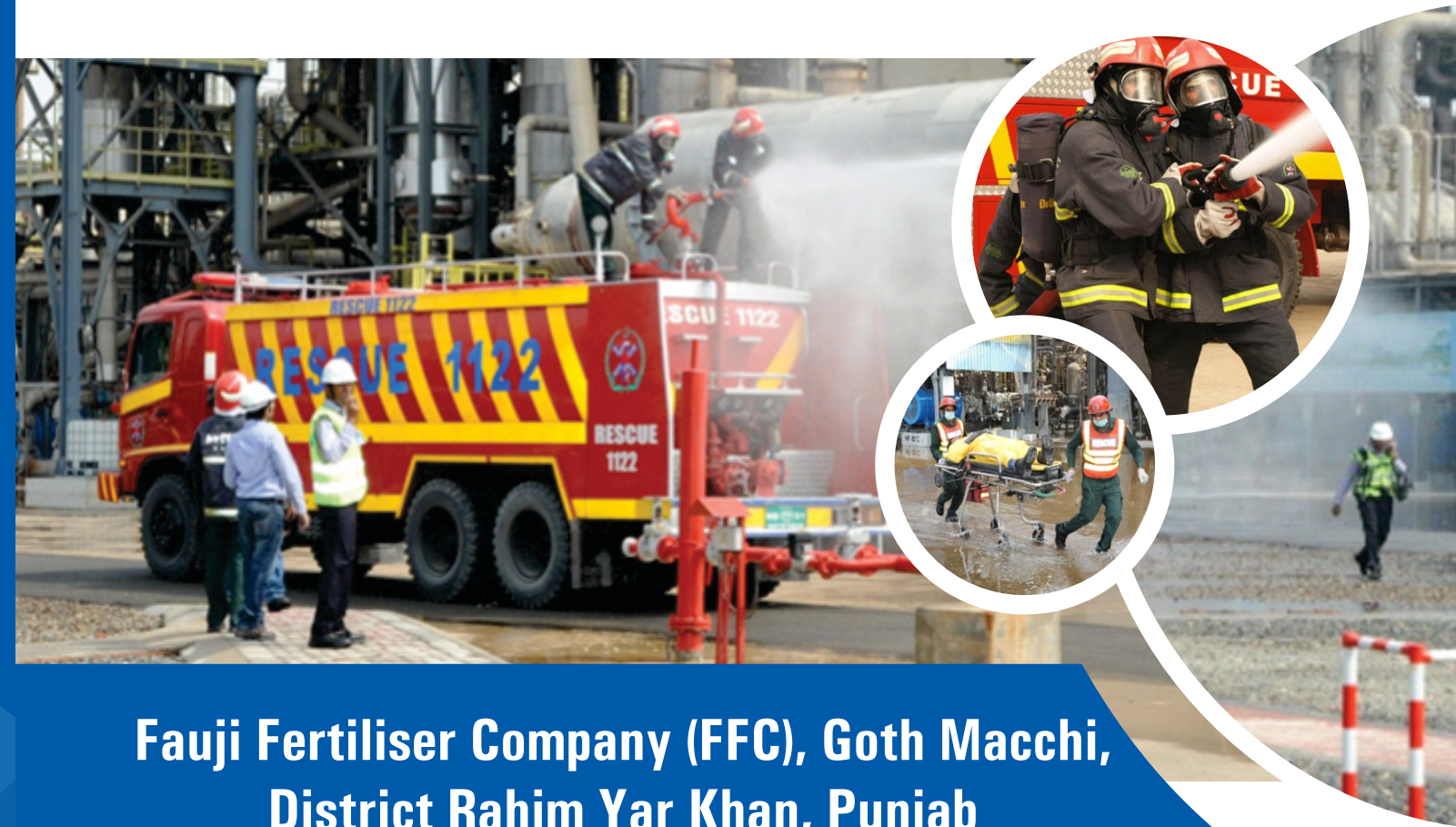
Fauji Fertiliser Company (FFC), Goth Macchi, District Rahim Yar Khan, Punjab