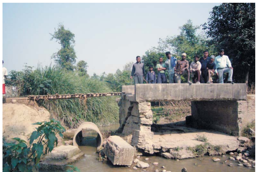
Local community standing on a bridge destroyed by flood, Singyali VDC, Mohottari District, Nepal

The maintenance of sustainable livelihoods is based on people's adaptation to environmental changes (including natural hazards) together with economic and political changes (Batterbury and Forsyth 1999). Researchers examining adaptations to natural hazards and disasters study adaptation in terms of social and power relationships also (political-economic perspective) and not only from a biological point of view (i.e., adaptation perspective) (Goodman and Leatherman 2001, p 21). Some studies focus on community adaptation to climate variability and climate change (Allen 2006; Ahmed and Chowdhury 2006; Rojas Blanco 2006; Hageback et al. 2005; Stiger et al. 2005) and multiple stresses, including natural hazards (McSweeny 2005). That said, these aspects still lack visibility in mainstream literature (Flint and Luloff 2005) and are neglected in practice, reflecting the compartmentalisation of science and the difficulty of overcoming it; and this is also reflected in government and donor budgets and the challenges surrounding (real) inter- and cross-disciplinary studies.