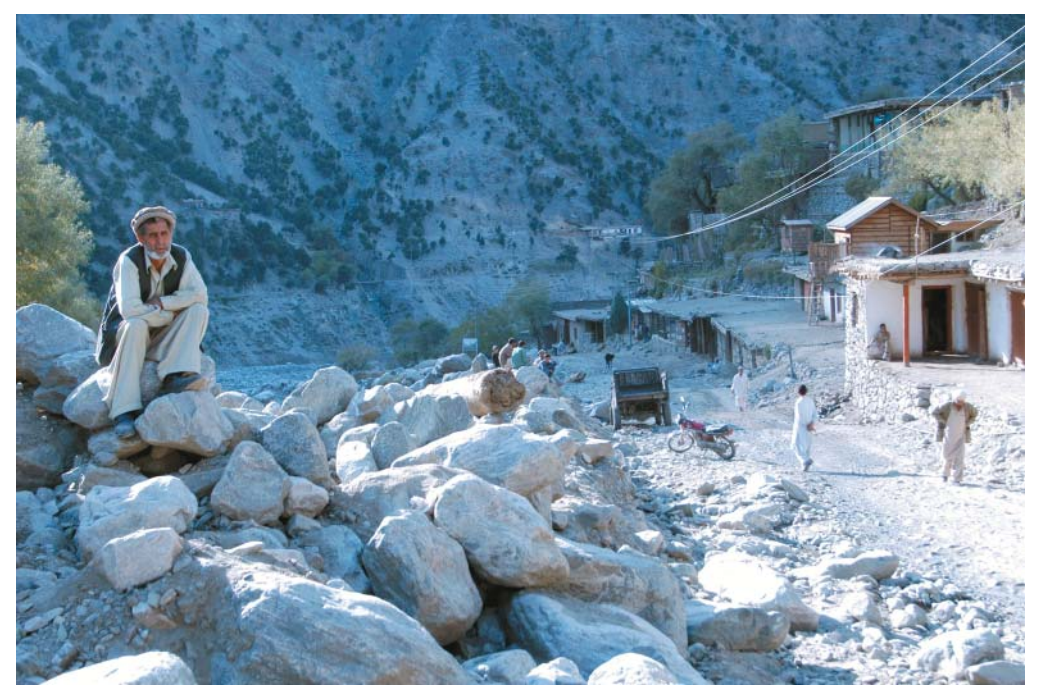
Man sitting on rocks deposited by a flash flood on the road from Chitral towards the Lawari Pass, Lower Chitral.