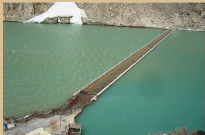
Submerged Shishkat-Gulmit Bridge