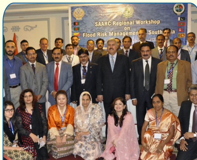
A Group photo of the participants of “SAARC Workshop on Flood Risk Management in South Asia” with the chief guest Rana M. Farooq Saeed Khan, Federal Minister for Climate Change.

Rana Muhammad Farooq Saeed Khan, the Federal Minister for Climate Change opening ceremony as the Chief Guest. He said that South Asian countries are facing the flooding problem because of the climate change and occurrence of floods has been seen increasing both in frequency and magnitude over the years. He stressed on the collaborative effort from the SDMC for a more rigorous approach toward disaster management at regional level.