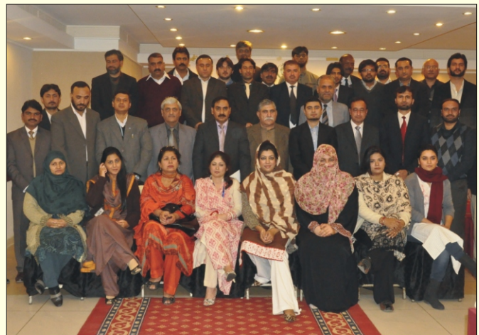
A Group Photo of Chairman NDMA with Participants of "Workshop on Mainstreaming DRM in Agriculture and Food Security" Jointly organized by NDMA and FAO

The main objective of the workshop was to reach a common understanding on the scope of Disaster Risk Management (DRM) and its role in the context of agriculture and food & nutrition security management, and to identify key opportunities and bottlenecks while framing a set of recommendations and action plans for mainstreaming DRM in Federal and Provincial institutions and policy.