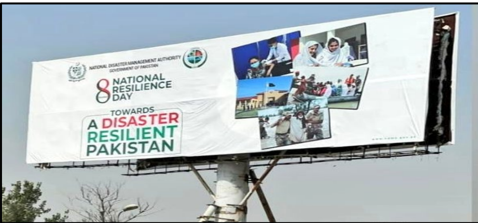
Public awareness campaign through city branding – 8 th Oct 2021