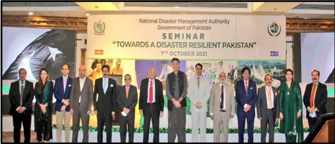
National Resilience Day Seminar on the theme of “Towards a Disaster Resilient Pakistan”