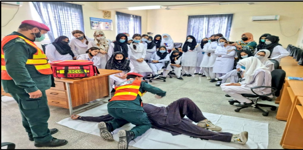
Basic First Aid Training in designated schools of ICT – 4 th - 13 th Oct 2021