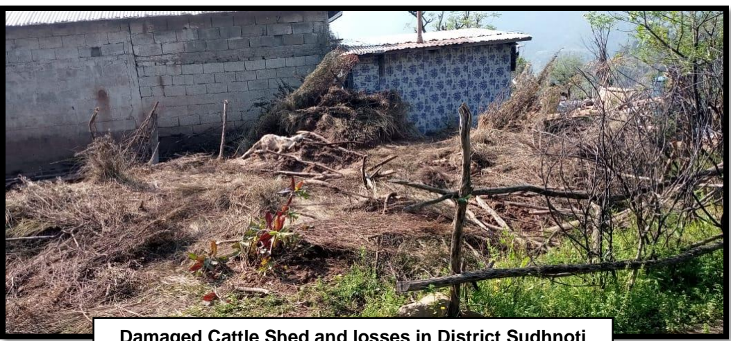
Damaged Cattle Shed and losses in District Sudhnoti